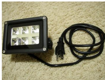
12w 365nm UV LED Outdoor Black Light

Your web is made from special 5mm (about 3/16") nylon rope that glows under a UV light (black light). Outdoors I recommend using two 12w UV LED outdoor black lights which are available for $34.95 at www.spiderwebman.net . It is near the top of the "Purchase" page.